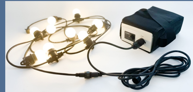
EnergyPoint battery supplied in bag to carry or hang from the handle