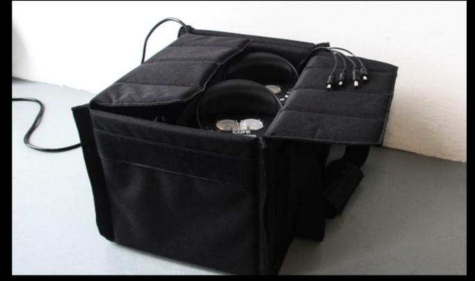
ColourPoint Mini Bag carries 4 units