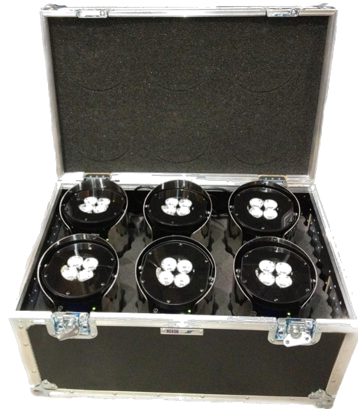
Charging Flight Case charges six ColourPoints

Can be installed as mains-powered permanent fixture with special order. Wireless DMX control