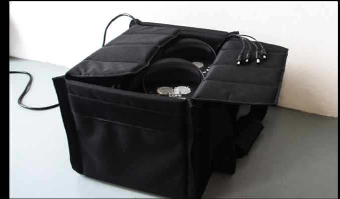
ColourPoint Mini Bag carries 4 units