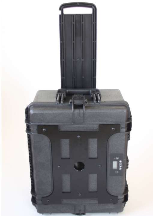
Rugged Wheeled Case with Handle

Display runtime selector with active current readout for peace of mind