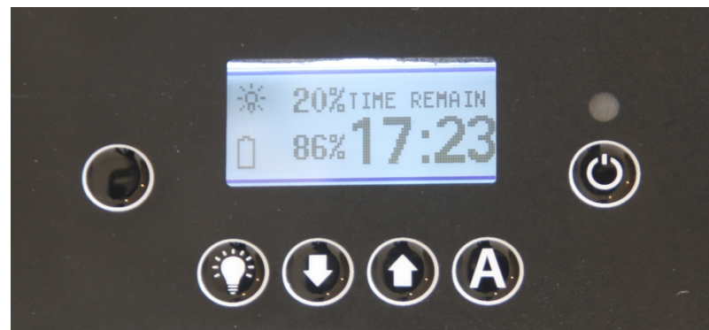
Active Runtime Selector/Readout